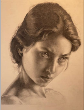
"Portrait of Dancer" is by Jake Watson, pencil on paper.

The show can be easily accessed with free parking and a handicapped accessible location. This is an opportunity to see artwork that combines focus and discipline to achieve old world craft and technique. In